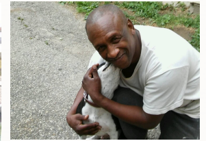
Weekly and often daily food deliveries