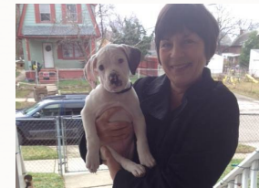
Spay / neuter procedures every week

Owners requesting help from ACN are required to have their animals spayed and neutered. Thanks to generous support from donations and sponsors, we have been able to provide these much-needed veterinary services. We service a large elderly population who struggle not only to feed themselves, but also their animals.