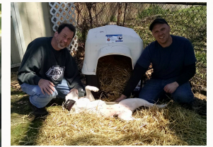
Providing life-saving shelter and straw