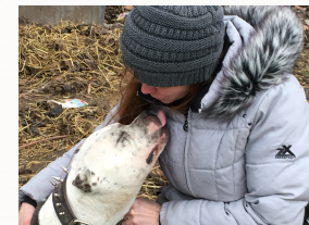
Providing welfare checks as often as needed

The Animal Care Network works alongside animal control, police departments, city workers, businesses and citizens with the shared goal of the animal's welfare in mind. Animals surrendered to the network are transferred to partners or are offered foster care until available for adoption.